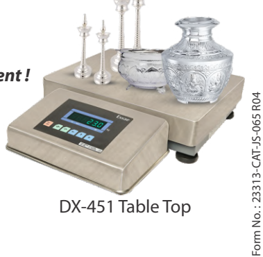
DX-451 Table Top