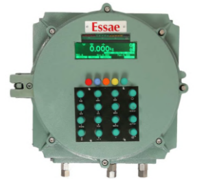
SI-850 FLP Indicator